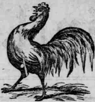
Entire State Ticket Elected.