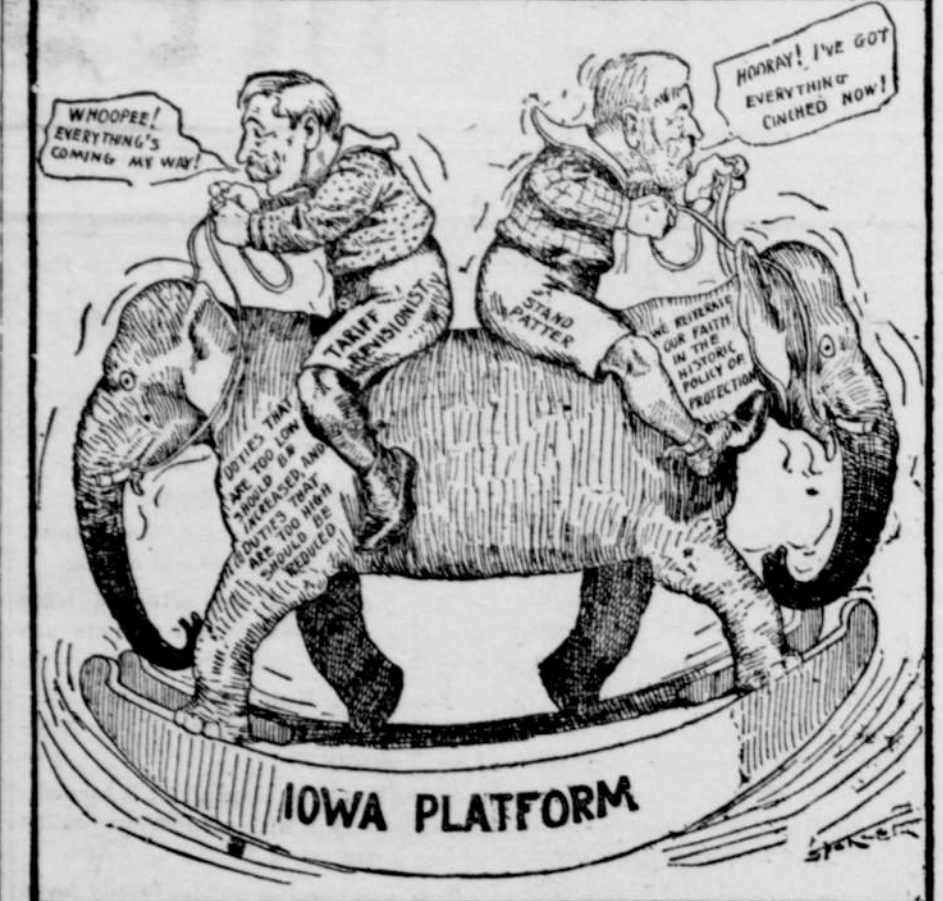
The platform leaves the way open for both sides of the "Iowa idea" contention to hold fast to their positions. - Omaha Bee.