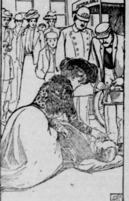
SHE TENDERLY WIPED HIS FACE.

The matter was far more serious to Mr. Gerry than was at first supposed. While he lay unconscious one of the