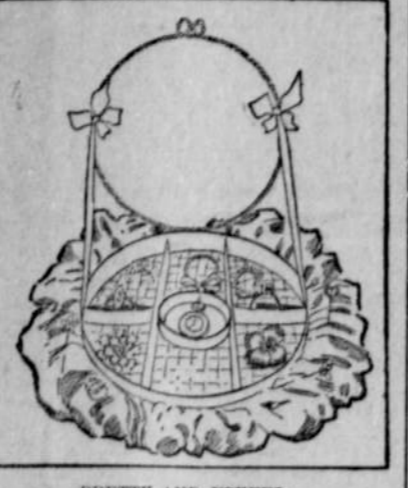
PRETTY AND USEFUL.

The March number of Ladies' Home Journal shows a neat jewel case and pincushion—that is made from a paste-