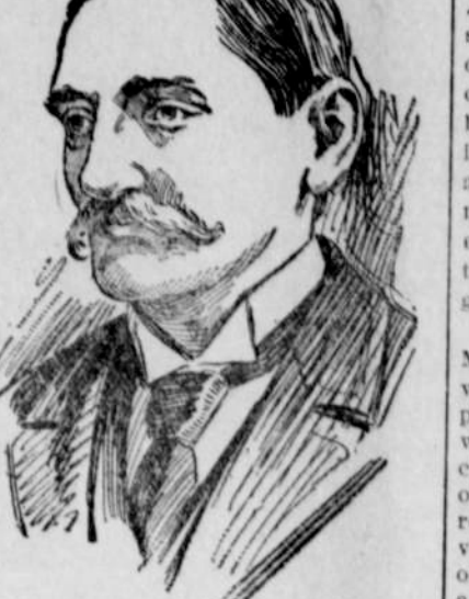
TOMAS ESTRADA PALMA.

Tomas Estrada Palma, the descendant of a distinguished Castilian family, has been called the Franklin of Cuba.