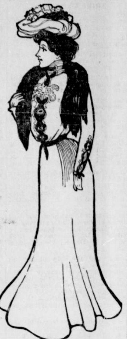
TAN CLOTH TOILET.

The toilet is of light tan cloth, with the long, gracefully trailing skirt adorned at either side of the front and in the middle of the back with a cluster of tiny short tucks. The blouse bodice is