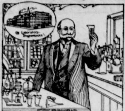
The Discoverer of Swamp-Root at Work in His Laboratory.

There is a disease prevailing in this country most dangerous because so deceptive. Many sudden deaths are caused by it—heart disease, pneumonia, heart failure or apoplexy are often the result of kidney disease. If kidney trouble is allowed to advance the kidney-poisoned blood will attack the vital organs, or the kidneys themselves break down and waste away cell by cell. Then the richness of the blood—the albumen—leaks out and the sufferer has Bright's Disease, the worst form of kidney trouble.