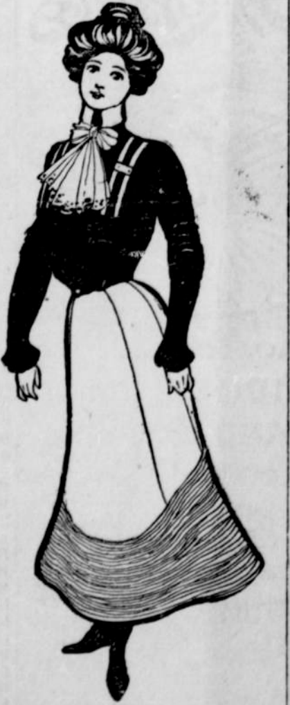
THIS IS FROM PARIS. cloth, with fancy braces of the same cloth. The scarf is of bright drab liberty silk.—Paris Herald.

This dress is composed of a tartan velvet body and corselet of bright drab