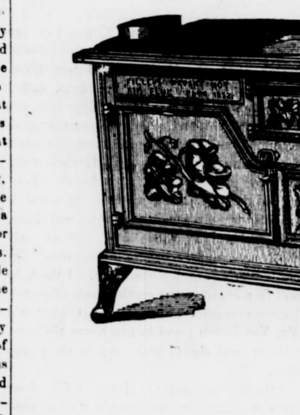
Cook Stoves, Different Styles.

HAY FORKS and RAKES, GRASS SCYTHES and SNATHS, WOODEN AND STEEL BARLEY FORKS, GRAPE VINE CRADLES, MANURE FORKS, GRAIN SCOPES, TRACE and HALTER CHAINS, CHOPPING and BROAD AXES, HATCHETS and HAMMERS, BENCH SCREWS,