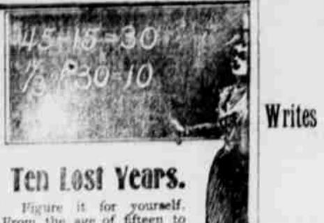
Figure it for yourself. From the age of fifteen to that of forty-five a woman gives one-third of her time to the suffering incident to the recurring periodic func-tion. Ten years of sufferingly and this condition of things is popularly accepted as a fem-mine disability for which there is no help! Indhere no help? There is help for every woman and for almost every woman perfect healing in the use of Dr.

The period covered is 1894 to from the United States in the five of $663,538,201. Of these enormous exports, about 60 per cent places and persons. found a market in the United Kingdom and its various dependannual value of $362,407,701.