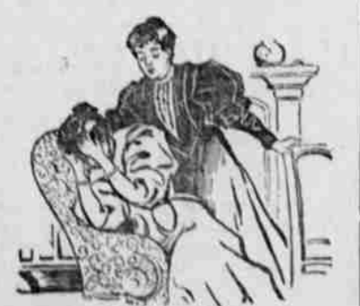
Love that Alters.