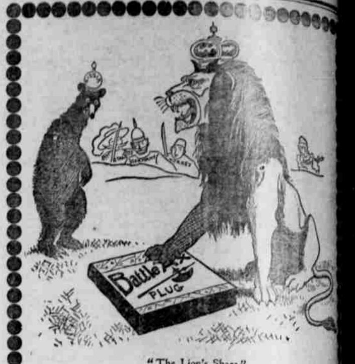
"The Lion's Share"