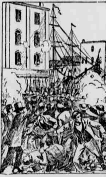
ATTACK UPON THE SIXTH MASSACHUSETTS IN BALTIMORE.

The reception accorded recently in Baltimore, Md., to the Sixth Massachusetts Regiment, on route to Falls Church, Va., to fight the Spaniards, was in striking contrast to that given