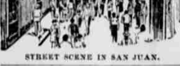
STREET SCENE IN SAN JUAN.

The first article stated that the patient (see address below) had been a paralytic for five years, that there was such a total lack of feeling in his limbs and body that a pin run full length could not be felt; that he could not walk or help himself at all; for two years he was not dressed; furthermore that he was blinded, was for that reason almost unrecognizable, and could not get his clothes on. The paralysis was so complete as to affect the face and pro-