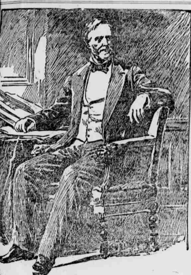
EX-SECRETARY OF STATE SHERMAN.