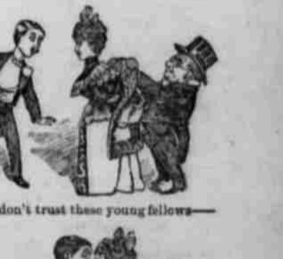
Disagreeable Father—Never mind, young man, I'll help her out with her coat myself.