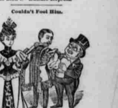
Couldn't Fool Him.