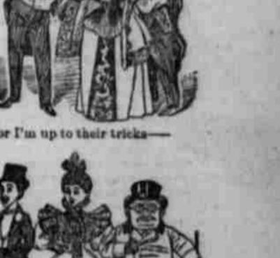
I don't trust these young fellows.