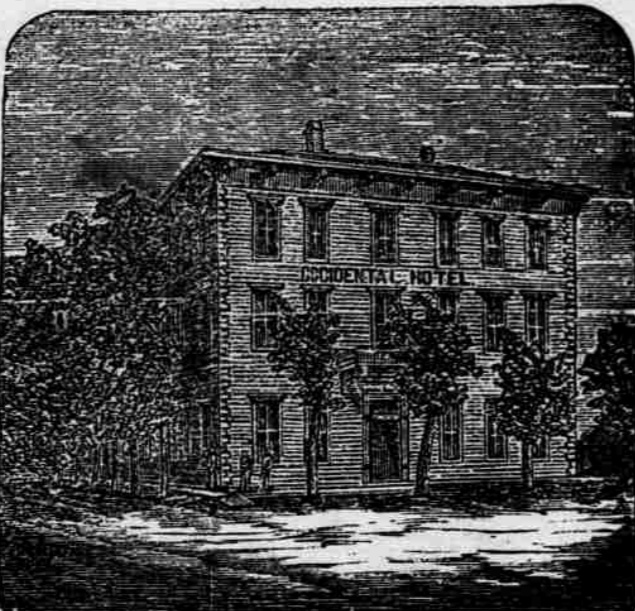
PRIEST-CLASS IN ALL ITS APPOINTMENTS.