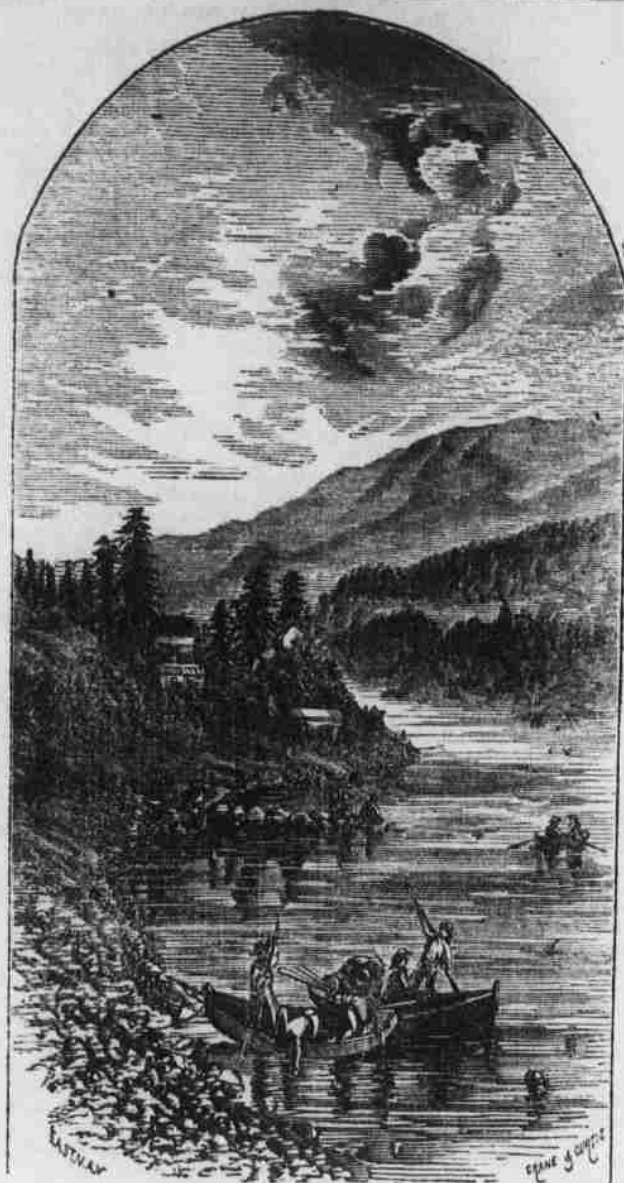
MIDDLE BLOCK HOUSE—CASCADES COLUMBIA RIVER.