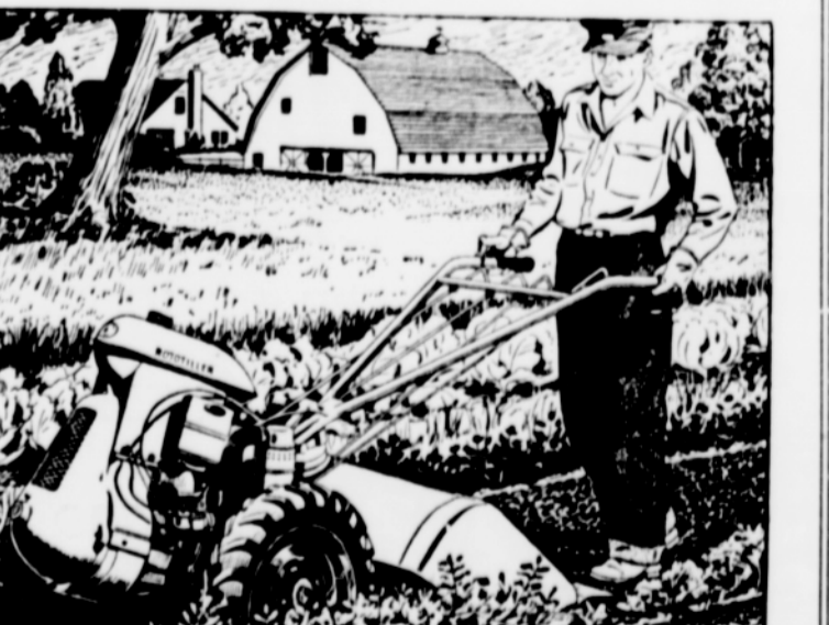
CULTIVATING WITH ROTOTILLER

Ask for a Demonstration GET THE ORIGINAL ROTO TYPE GARDEN TRACTOR