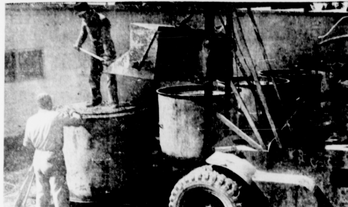
THE LARGE KETTLE-LIKE contrivances pictured are actually molds for the concrete which go into the making of 48-inch concrete pipe sections at The McCormack Co. near Hillsboro. The concrete is carried to the molds with the lifting machine shown and shoveled into the molds. Making of large pipe sections requires much handwork.