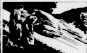
Proved on the toughest grades . . . the new Chevrolet takes hills in its stride. Its power will thrill you.

Mile after mile they put it through its paces . . . proved its speed, its acceleration, its economy!