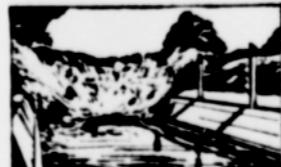
This is where Chevrolet for 1949 was PROVED to be weather-proof and waterproof.

At the General Motors Proving Ground there are men who are experts at ruining cars! "Find the flaws . . . get the facts" is their motto. And so, when Chevrolet for 1949 was delivered to their "tender" mercy, they put it through its paces so vigorously and so thoroughly that there was no chance for basic weaknesses to go undetected. What a break for the buyer . . .