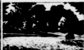
The punishing granite blocks of this "torture trail" PROVED Chevrolet's ability to absorb punishment!