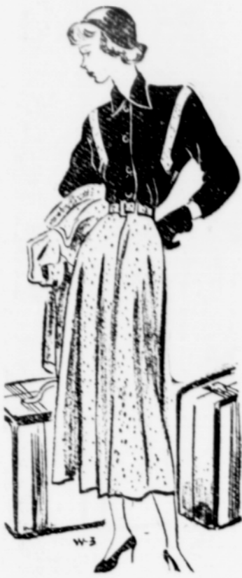
A handsome tweed outfit.

Beautiful color tones distinguish the autumn dress parade. Linton tweeds in a lavender shade is combined with purple wool jersey to make this charming coat and dress ensemble. It is wearable, young, and good for travel, college and general wear. The one-piece dress has a two-piece look and uses set-in bands of the tweed to outline the deep armhole. The coat is simple, loose-swinging, and is lined in the purple jersey of the dress top.