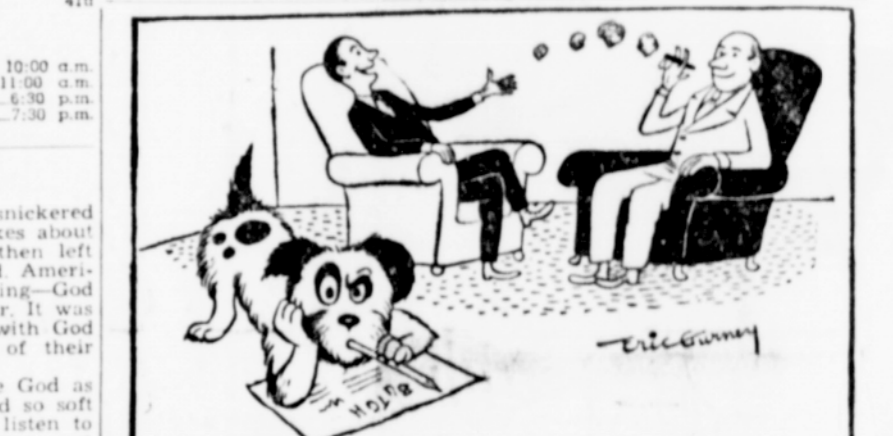
"He's trying to figure how we'll split the $25,000.00 Family Sweepstakes Prize in the Pepsi-Cola 'Treasure Top' Contests."

I received Christ as my personal Saviour 25 years ago. He now looms greater in my heart and thinking than when I first believed.