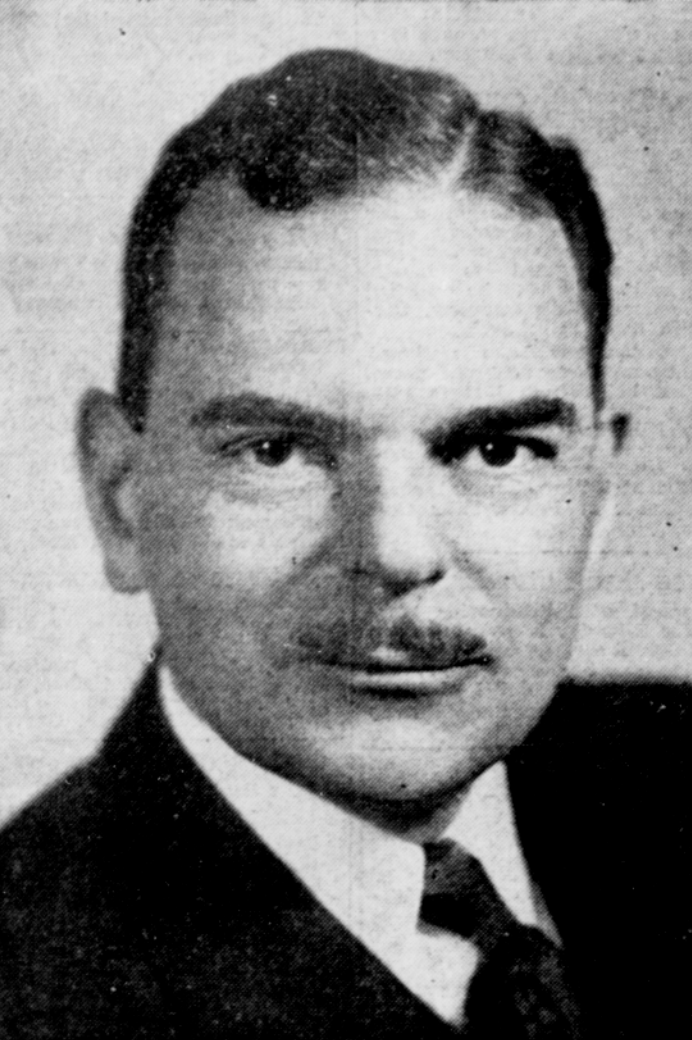
DEWEY TO SPEAK IN HILLSBORO —Governor Thomas E. Dewey of New York will be the second presidential candidate to visit Hillsboro in 48 years when he gives his campaign speech from the court house steps Saturday morning. He is scheduled to talk at 9:15 a.m.