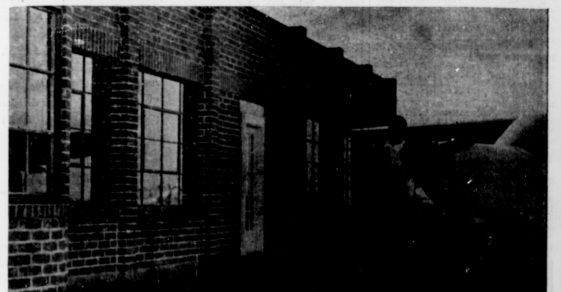
AVIATION PROGRESS —Hap Oslund is owner of the above attractive hangar which was first brick structure completed at Hillsboro municipal airport. The local air field is rated one of the best in the northwest because of its lengthy, wide hard-surfaced runways and special taxi strip. The building was one of scores of new structures put up throughout the county during the past year.