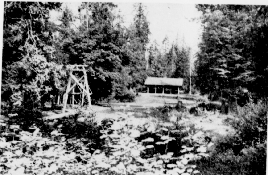
SCOUTS' SUMMER HOME —The big Hillsboro District Boy Scout barbecue to be held next Wednesday evening at Shute park will provide some of the fun as necessary to inaugurate a beautification program for the Boy Scout camping site, Camp Ireland. Located just a few miles north of Hillsboro, the camp needs more parking space, an improved swimming place, enclosure of the pop-wow shelter (shown in background), improvement of toilet facilities, a caretaker's house, a fence around the camp and repairs on the wooden, cable bridge (shown at left).

Teen-agers are much more interested in taking an active part in things they know about and understand. This basic principle can be applied to their present record in traffic accidents. They may be aware that their record as drivers is the worst of any age group, and that casualties are mounting at a serious rate, but they aren't going to feel personally responsible for bettering their traffic record unless they have an understanding of what the traffic problems are and what can be done to solve them. A well-planned field trip might open the eyes of teen-agers, and show them how they can improve their record. Let them see how their city or state copes with the traffic problem. There are several city offices or state departments that would be well worth visiting on such a field trip. A few of the more important are the traffic court, the highway department, the traffic engineer's office, and the accident record bureau. The opportunities for teen-agers to see "traffic safety in the making" are many. A well-planned, successful teacher can, through projects such as are suggested here, provide valuable learning experiences.