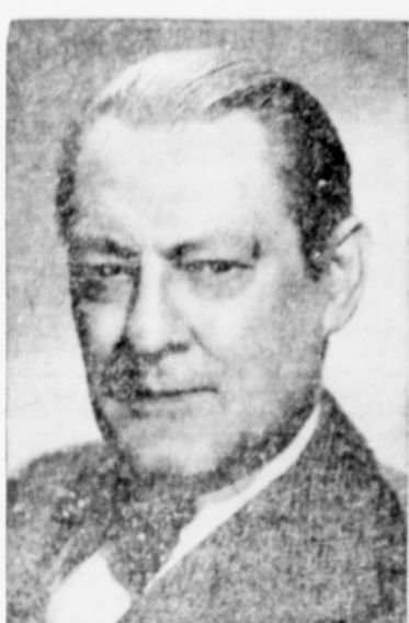
CHAIRMAN—Lionel Barrymore heads the national board of sponsors of the National Arthritis Research Foundation.