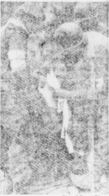
Bonds for mercy! Bandaging a wounded comrade in Italy is a commonplace scene on every fighting front. Much of the money you lend your government by buying Bonds goes into medical aid for your fighting relatives and friends. Keep up your Bond buying. Buy an extra Bond today. U. S. Treasury Department