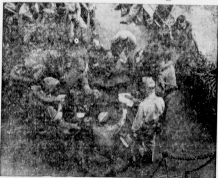
U. S. Marines check their weapons and review automatic rifle lessons aboard transport taking them to the Solomon Islands. How well these Leathernecks knew their studies is now known throughout the world.