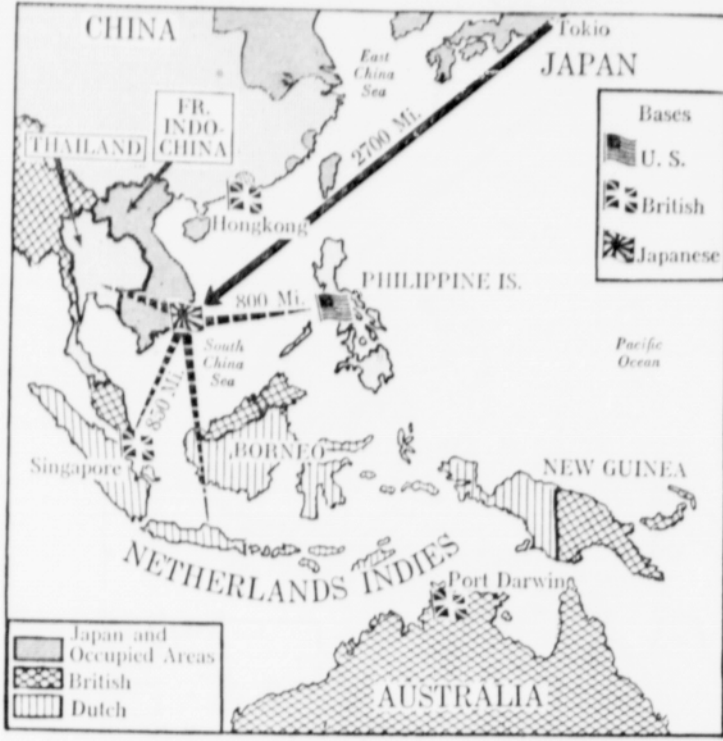
Graphically illustrating new developments resulting from Japan's seizure of French Indo-Chinese bases, this map shows American, British and Japanese outposts against Japan have already been taken as result of the new move.