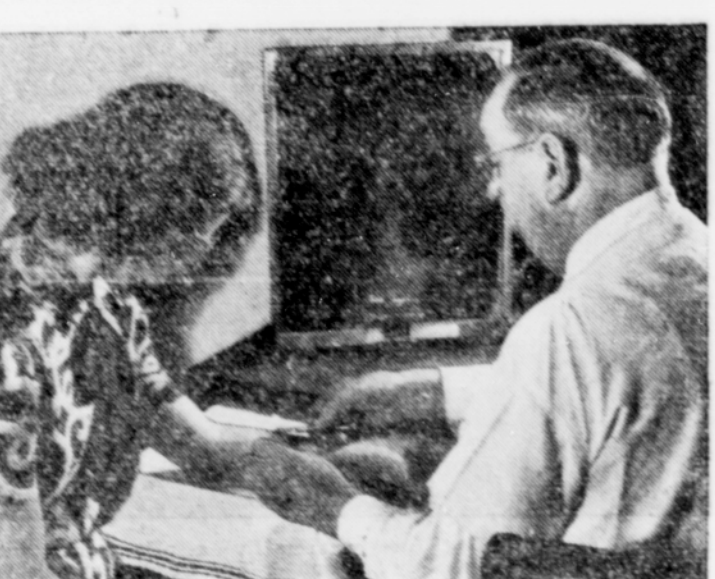
College student receiving test to find if tuberculosis germs are present. Early Diagnosis Campaign is being conducted by tuberculosis associations throughout the United States this month.