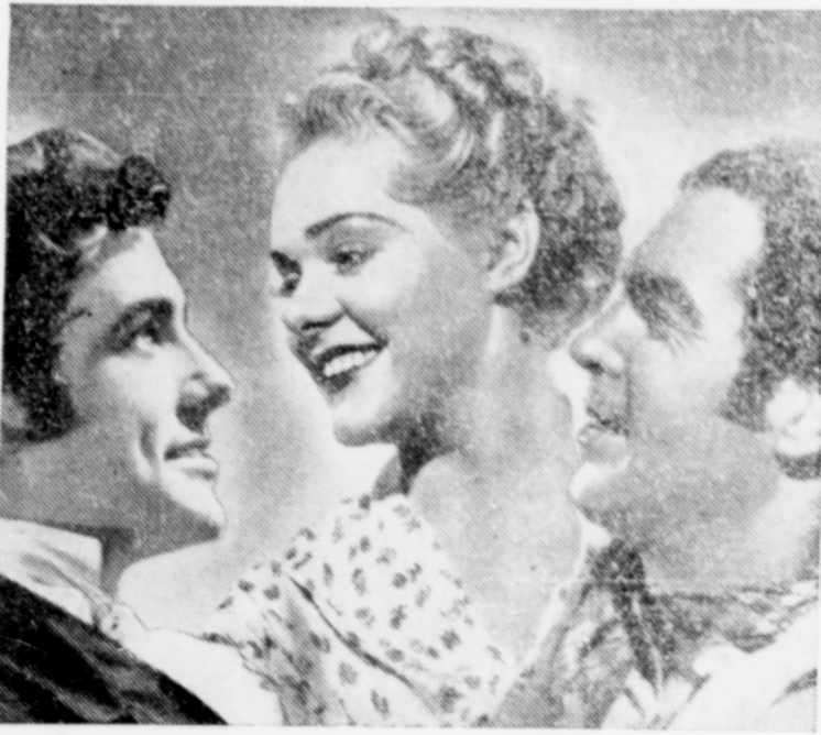
Richard Greene, Alice Faye and Fred MacMurray, feature stars of "Little Old New York" which opens a four-day run at the Hill theatre Sunday. The story concerns Robert Fulton and the building of the first steamboat.