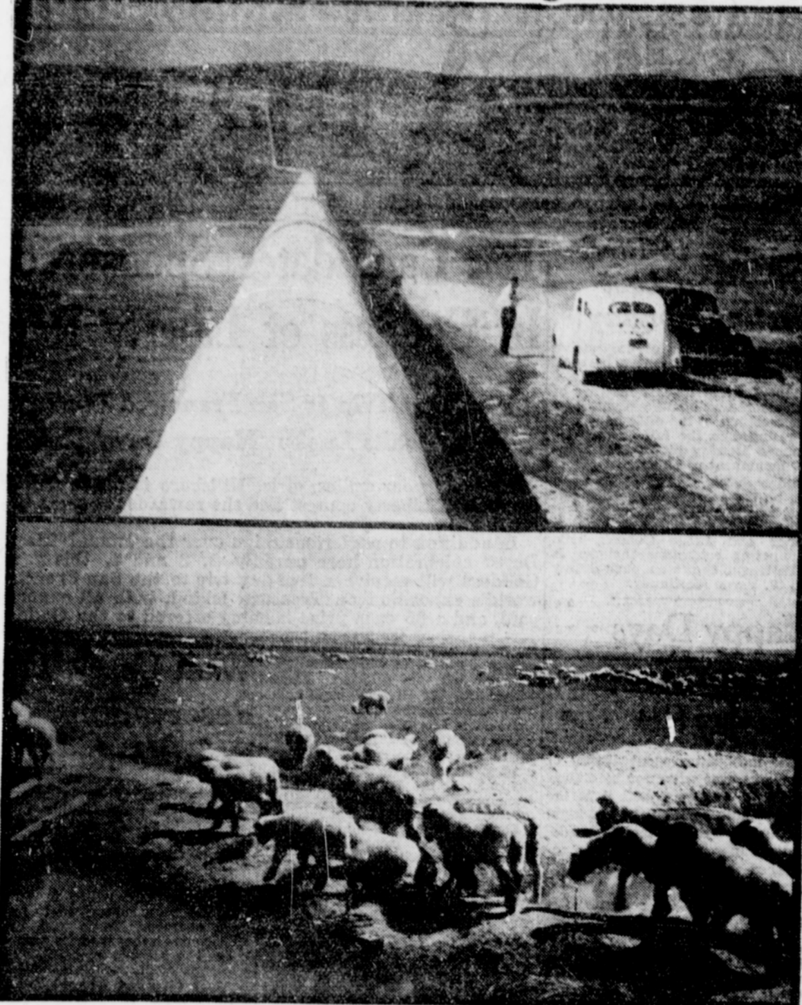
Above, a huge siphon carrying water 4 1/2 miles for watering crops; below, sheep grazing along banks of an irrigation ditch.

This newspaper is co-operating with the Oregon State Motor association and The Oregonian in presenting a series of motorlogs designed to stimulate travel in Oregon and the Pacific northwest. This article was condensed from a full page article appearing in The Oregonian June 4.