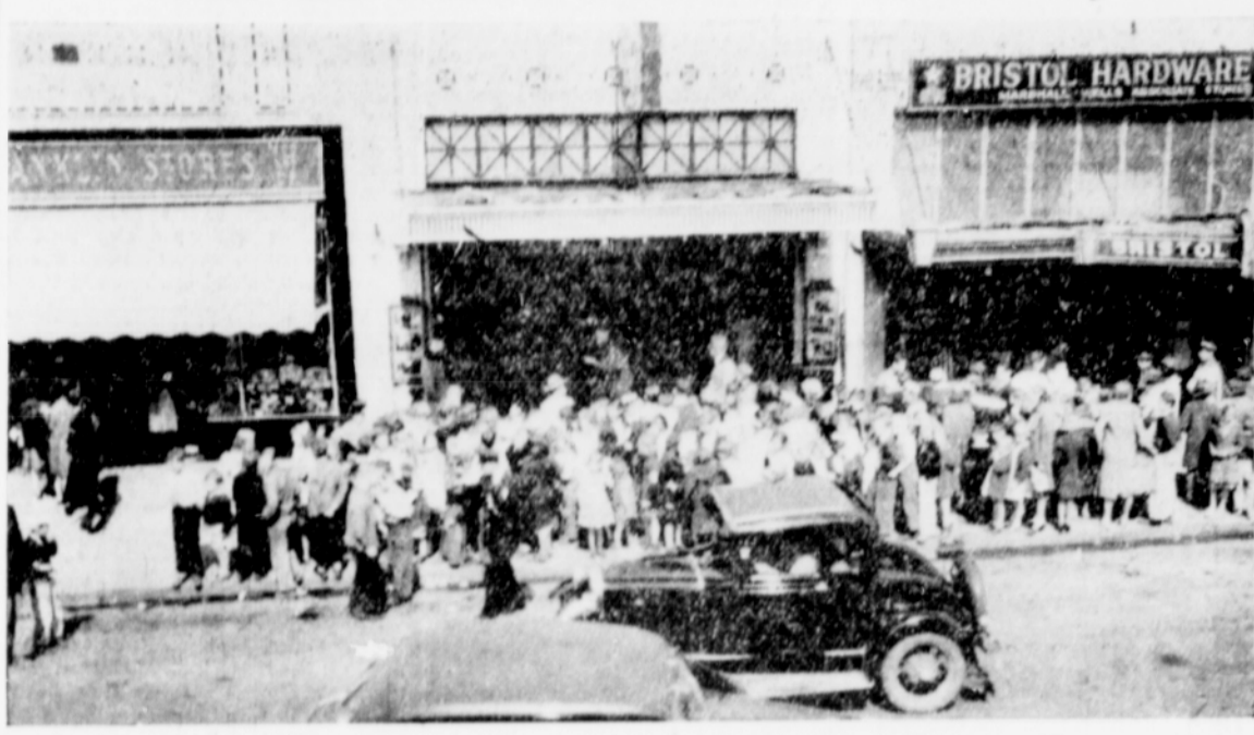
A portion of the crowd of youngsters who jammed the Venetian theatre entrance Saturday is shown in the picture above. The theatre program was part of an Easter festivity program held in Hillsboro annually for Washington county children.