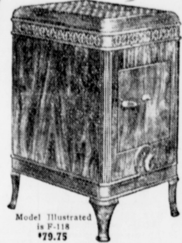
Model Illustrated is P-118 $79.75

Let us Appraise your Old Heater Right Now!