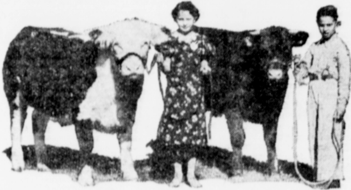
Boys and Girls from six Western states to show actual results of work done in livestock, crop, home economics fields.

Practical demonstrations of 4-H Club work will be staged on Tuesday, October 5, and Wednesday, October 6, by teams from six Western states during the Pacific International Livestock Exposition to be held in Portland from October 2 to 10, inclusive.