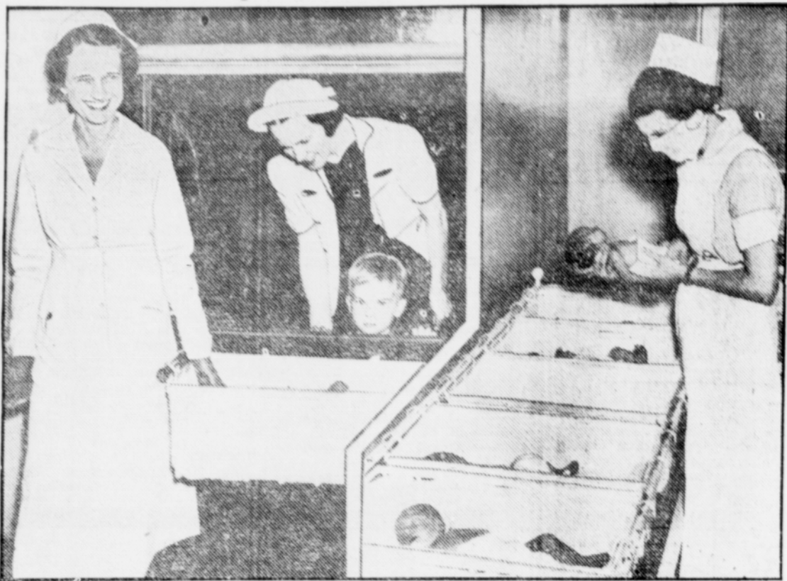
Science displaces sentiment in the baby ward of this Atlanta hospital, although proud papa may not be wholly in accord with the policy. The arrangement is part of Emory University Hospital's strictly scientific handling of new-born babies.