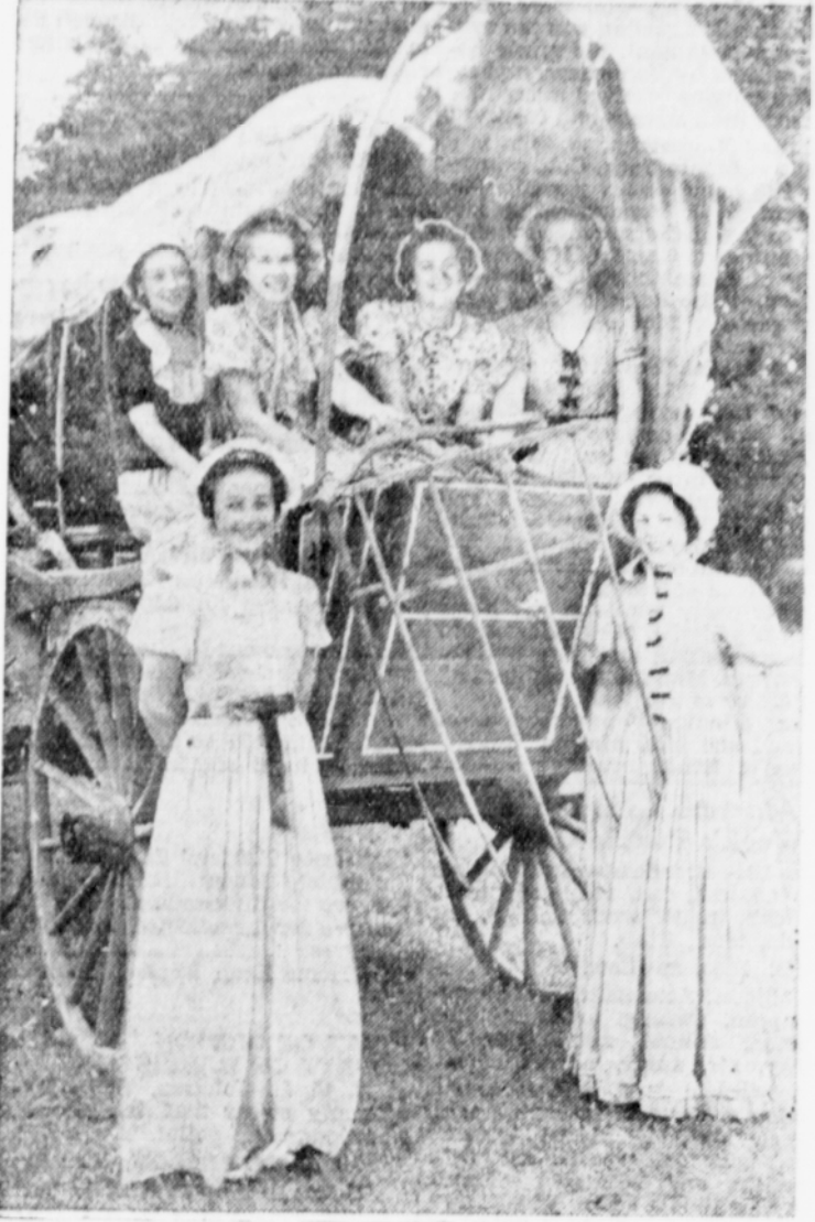
Six attractive Eugene girls, dressed in the pioneer styles of frontier days, are shown here with an old-fashioned covered wagon, one of the many hundreds of authentic relics which will be publicly displayed during the Oregon Trail Pageant celebration in Eugene July 22, 23 and 24. The quaint costumes worn by the maids are the vogue in Lane county as the entire citizenry makes ready for the fourth celebration in honor of our Western forefathers who settled in the Oregon country. The pageant is held in Eugene every three years and is internationally famous.