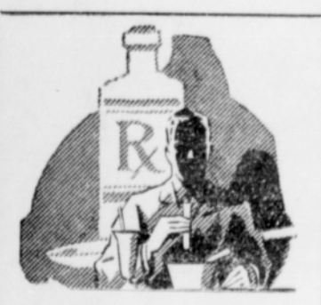
Time is Often a Great Factor in the Drug Business

Our classified columns may have Just what you are looking for-Read them.