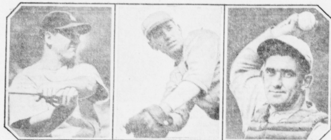
Three great representatives of American baseball are these men: left to right, Lou Gehrig, Iron Man of the Yankees; Dizzy Dean of the Cardinals, and Mickey Cochrane, catcher for the Tigers.