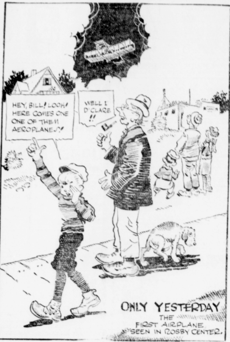
ONLY YESTERDAY THE FIRST AIRPLANE SEEN IN ROSSBY CENTER.