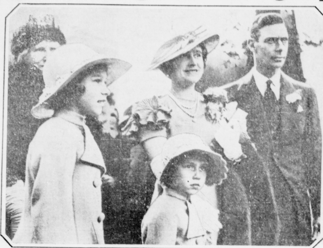
Suddenly made ruler of the greatest of world empires Britain's new king personifies the traditional family man of British life. Here is a recent picture of the new monarch with his wife and two daughters, Princess Elizabeth, left, now their presumptive to the throne, and Margaret Rose.

ABDICATION of the British throne by Edward VIII for the love of the American divorcee, Mrs. Wallis Warfield Simpson, brings to the rulership a new king, George VI, strikingly reminiscent of the late George V. For Albert Frederick Arthur George, former Duke of York, is practically the antithesis of his older brother. While Edward chose globe trotting, Albert spent his youth in the navy, married, and has two charming daughters, Edward loved sports, dancing, and the gayer side of life. The new monarch has preferred the seclusion of his study. Edward was essentially a cosmopolitan. Albert's interests have been more confined. He has taken an especial interest in industrial matters. The second son and second child of the late King George V and Queen Mary, Albert was born Dec. 14, 1895, at York Cottage, Sandringham. He and the Prince of Wales, only a year and a half older, were playmates, had the same tutors. Later the two went through military work together.