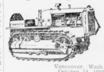
Vancouver, Wash. October 14, 1936