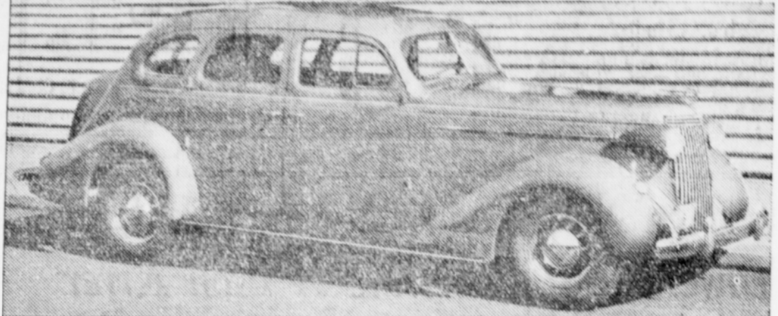
The new 1937 Nash-LaFayette, now being handled in Hillsboro by the Used Car Exchange. The