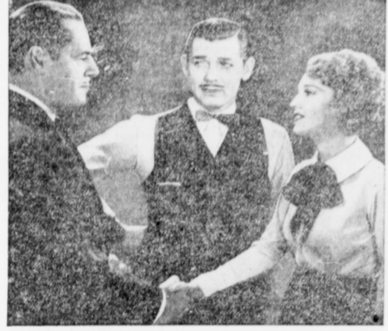
Jack Holt, Clark Gable and Jeanette MacDonald, who star in "San Francisco," coming to the Venetian Sunday, Monday and Tuesday.