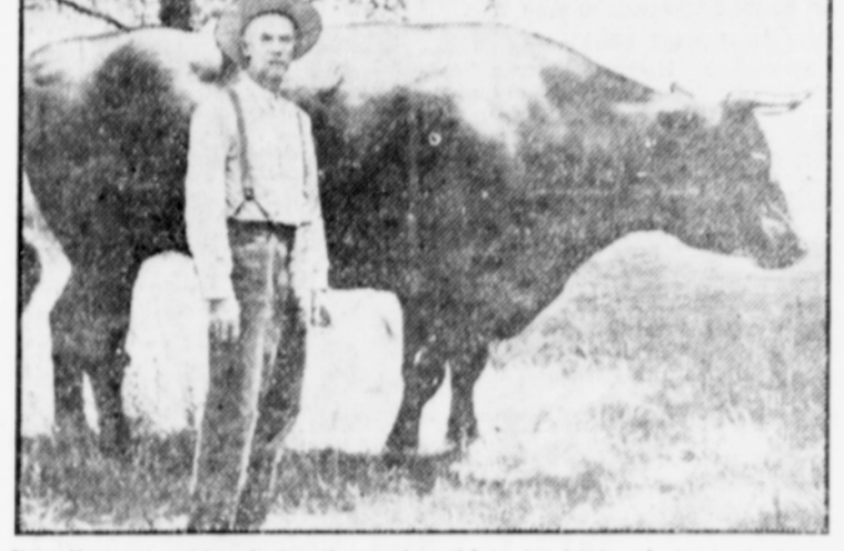
Big Jim, a purebred shorthorn, is said to be history's largest steer. The animal stands 6 feet 2 inches, at the shoulder, and weighs 4026 pounds.