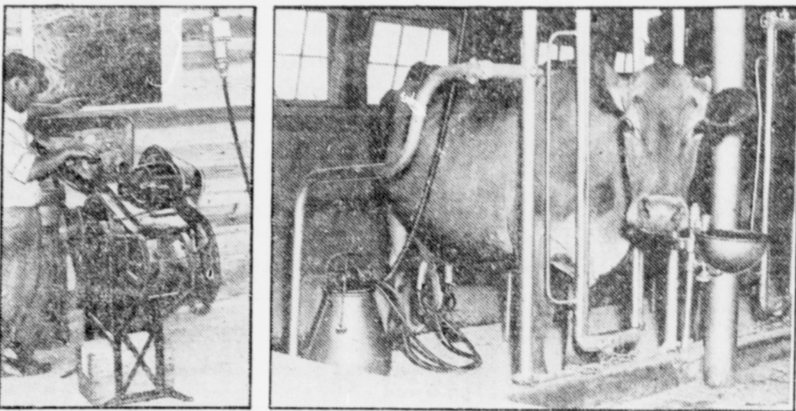
The Rural Electrification Administration's model all-electric farm at Rosedale Farm, Va., demonstrates remarkable progress toward lightening of farm work by means of electrical devices. The above pictures show some of the equipment in operation. Upper left, electrified kitchen; upper right, electrical milk cooler; lower left, electric corn sheller; lower right, electrical milker.