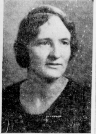
operated with the Oregon Gas Appliance society in staging the contest. The gas range prize was donated by the gas company.