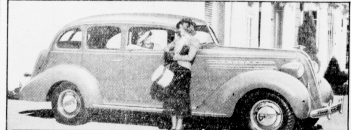
"Cars are like hats . . . it pays to look at them all!"

REMEMBER DAIRY FEEDS I. X. L. POULTRY FEEDS HILLSBORO FEED CO. Phone 271 160 W. Main St.