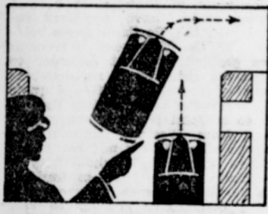
DON'T CUT ACROSS TRAFFIC LINES

careful will pay dividends in damages averted and lives saved. Tremendous benefits will be derived from conscientious observance of