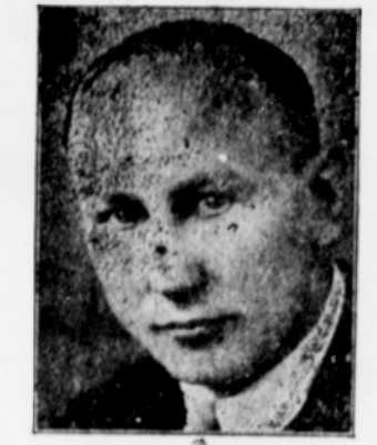
PLATE REPAIRS Fillings, Bridges Extractions, Inlays PERSONAL SERVICE