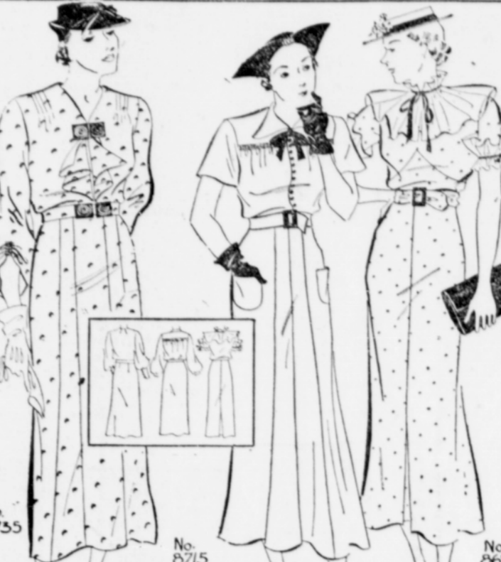
No. 8755 No. 8715 No. 8694

THE style-knowing woman will approve of the decorative jacket and clip adorning the waist front of Pattern 8735. Sizes: 34 to 48. Size 36 requires 5 1/2 yards of 39-inch fabric. The port ribbon tie, buttons on waist front and square belt buckle fit in well in a contrast motif, making Pattern 8715 a charming daytime frock. Designed in sizes 12 to 20. Size 14 requires 4 1/2 yards of 39-inch material.