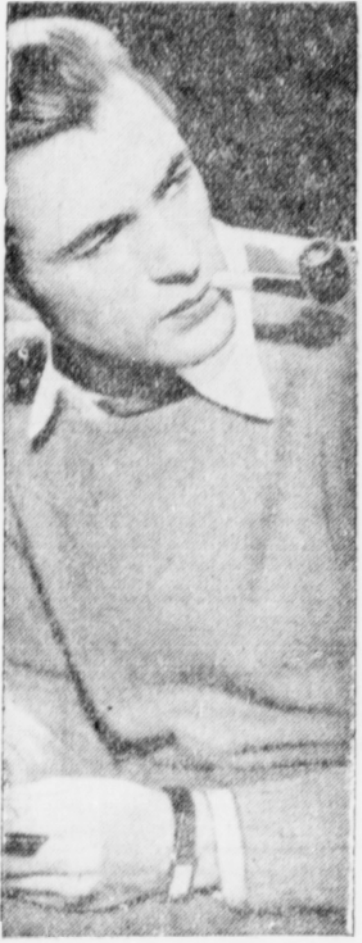
Gary Cooper is co-starred with Marlene Dietrich in "Desire," romantic new comedy coming to the Venetian Sunday, Monday and Tuesday.