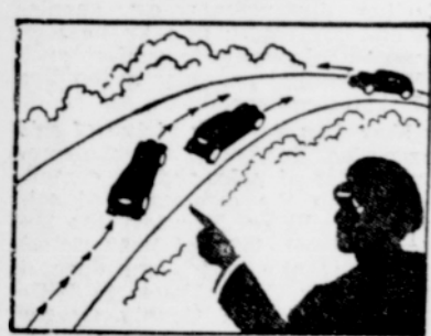
Don't Try to Pass on a Curve or Hill

Observance of this simple traffic rule would save thousands of lives annually. Think! Don't add to the awful death toll.