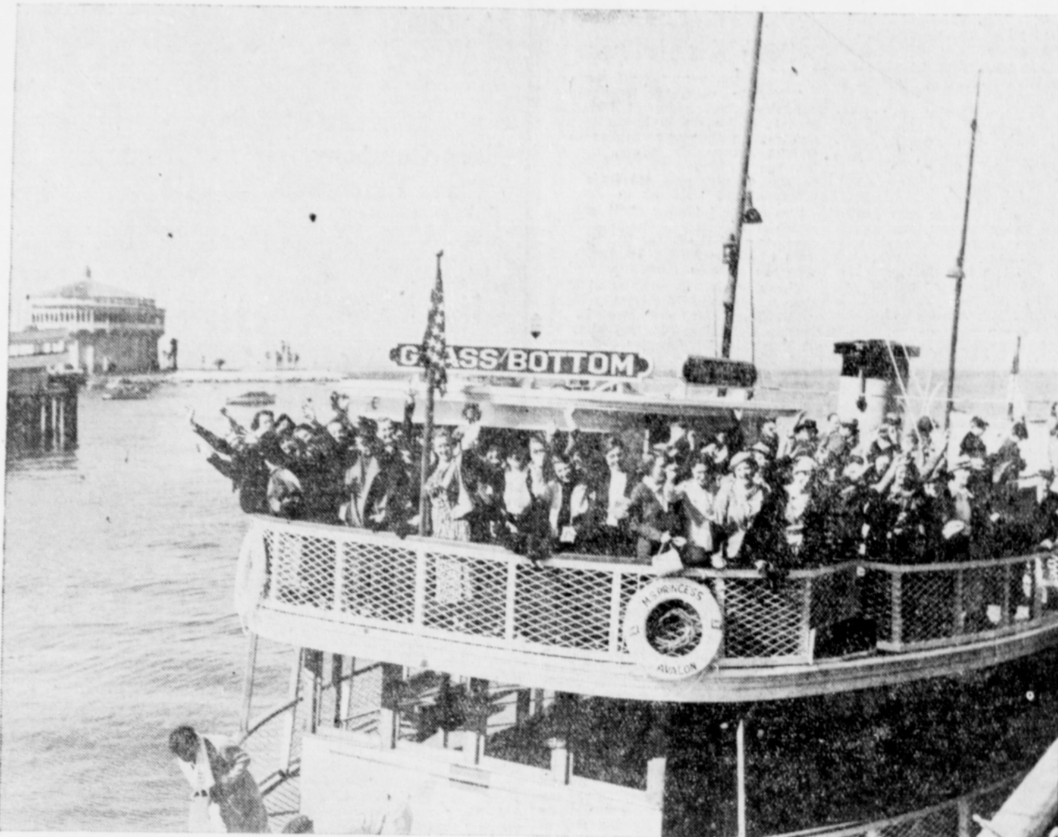
Forty Good Will tour winners from Oregon, Washington and Alaska cities, enjoying the famous glass bottom boat trip over the submarine gardens of Santa Catalina Island.